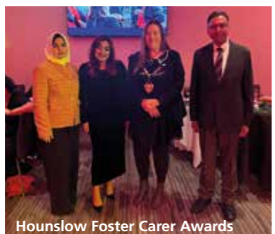
Hounslow Foster Carer Awards