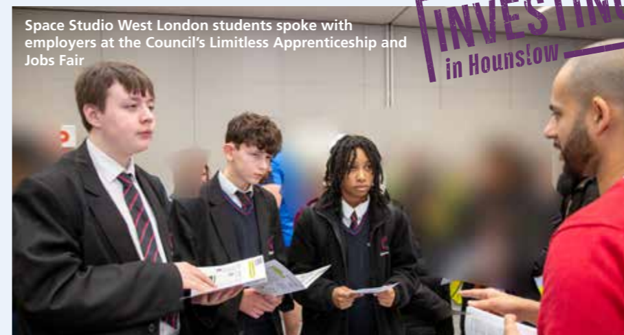
Space Studio West London students spoke with employers at the Council's Limitless Apprenticeship and Jobs Fair