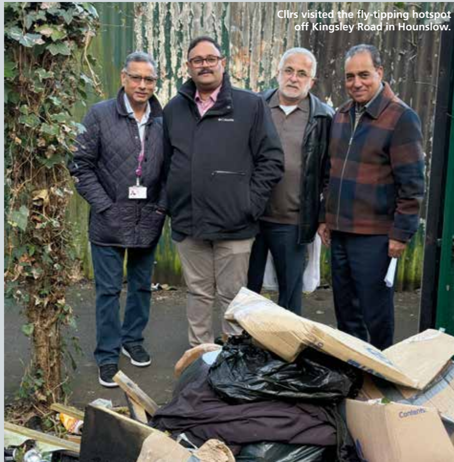
Cllrs visited the fly-tipping hotspot off Kingsley Road in Hounslow.