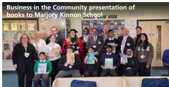
Business in the Community presentation of books to Marjory Kinnon School