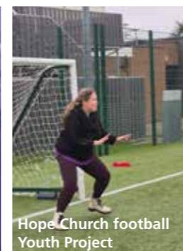
Hope Church football Youth Project