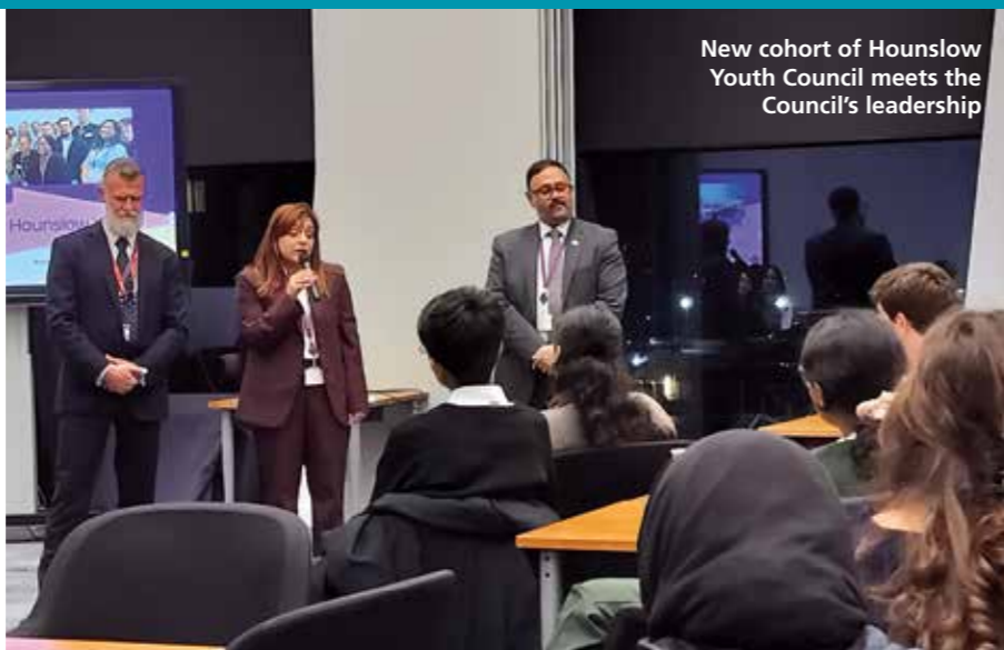
New cohort of Hounslow Youth Council meets the Council's leadership

If you're interested in finding out more about Shared Lives / becoming a carer go to: www.hounslow.gov.uk/shared-lives