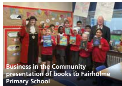
Business in the Community presentation of books to Fairholme Primary School