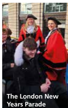
The London New Years Parade