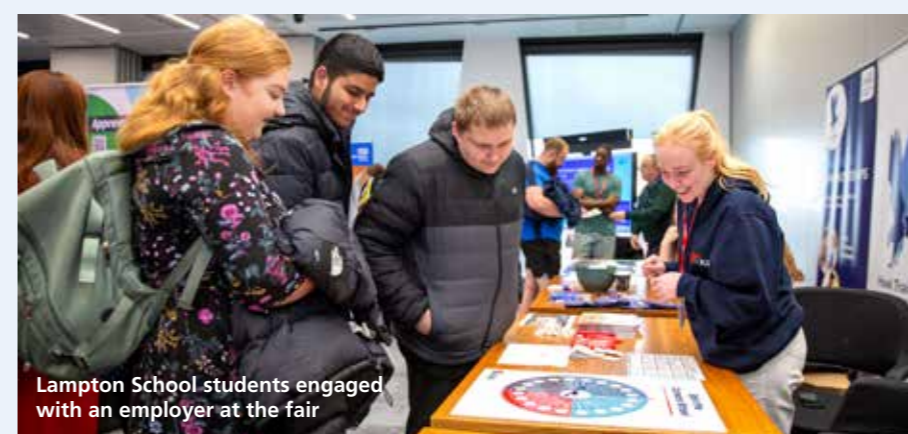
Lampton School students engaged with an employer at the fair

Over 200 young people aged 14 and over, including students with special educational needs and disabilities (SEND) from local schools and West Thames College, attended the Council's Limitless Apprenticeship and Jobs Fair at Hounslow House during National Apprenticeship Week.