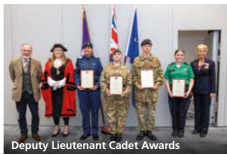
Deputy Lieutenant Cadet Awards