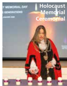
Holocaust Memorial Ceremonial