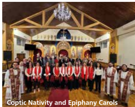
Coptic Nativity and Epiphany Carols