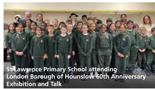
St Lawrence Primary School attending London Borough of Hounslow 60th Anniversary Exhibition and Talk