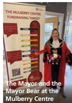
The Mayor and the Mayor Bear at the Mulberry Centre