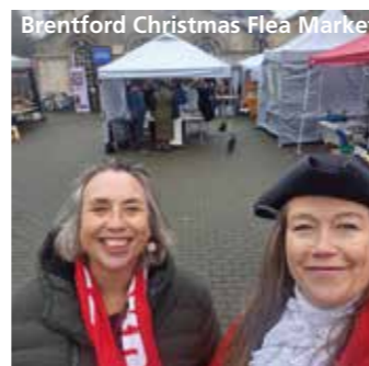
Brentford Christmas Flea Market