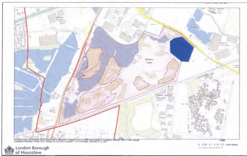
Bedfont Lakes Country Park (North) Map