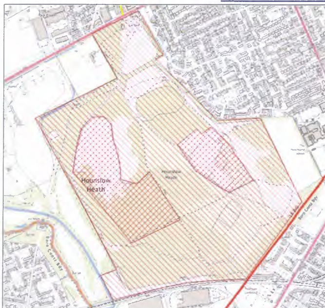
Hounslow Heath Map