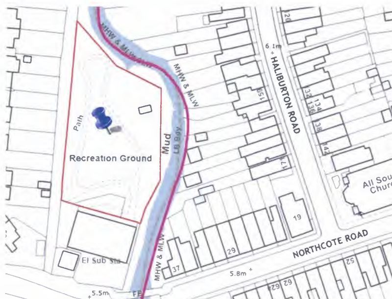
MAP D – Northcote Nature Reserve: