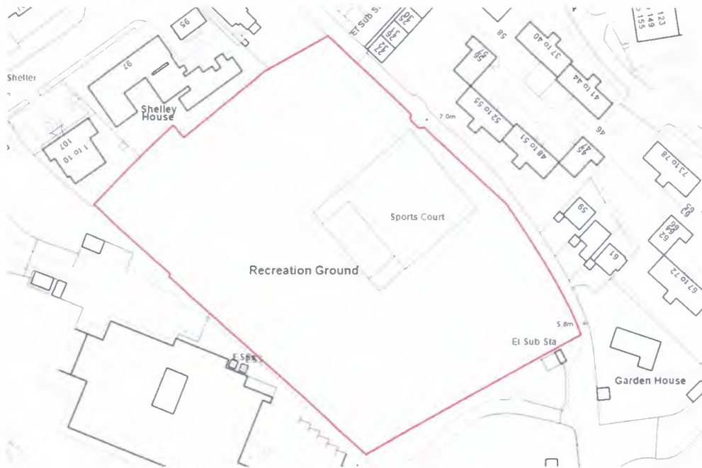
MAP F – Stamford Brook Common Recreation Ground: