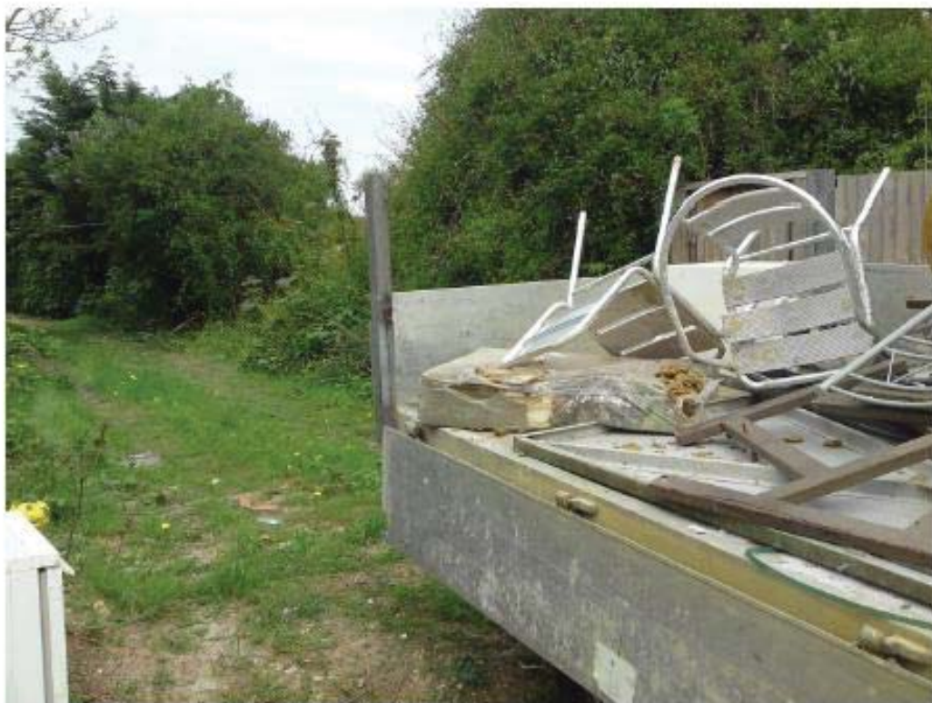
Rear access - clear