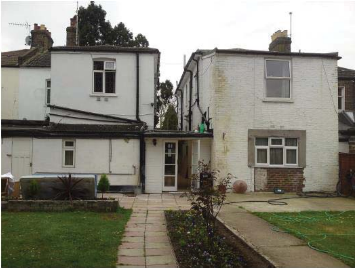
Rear of property