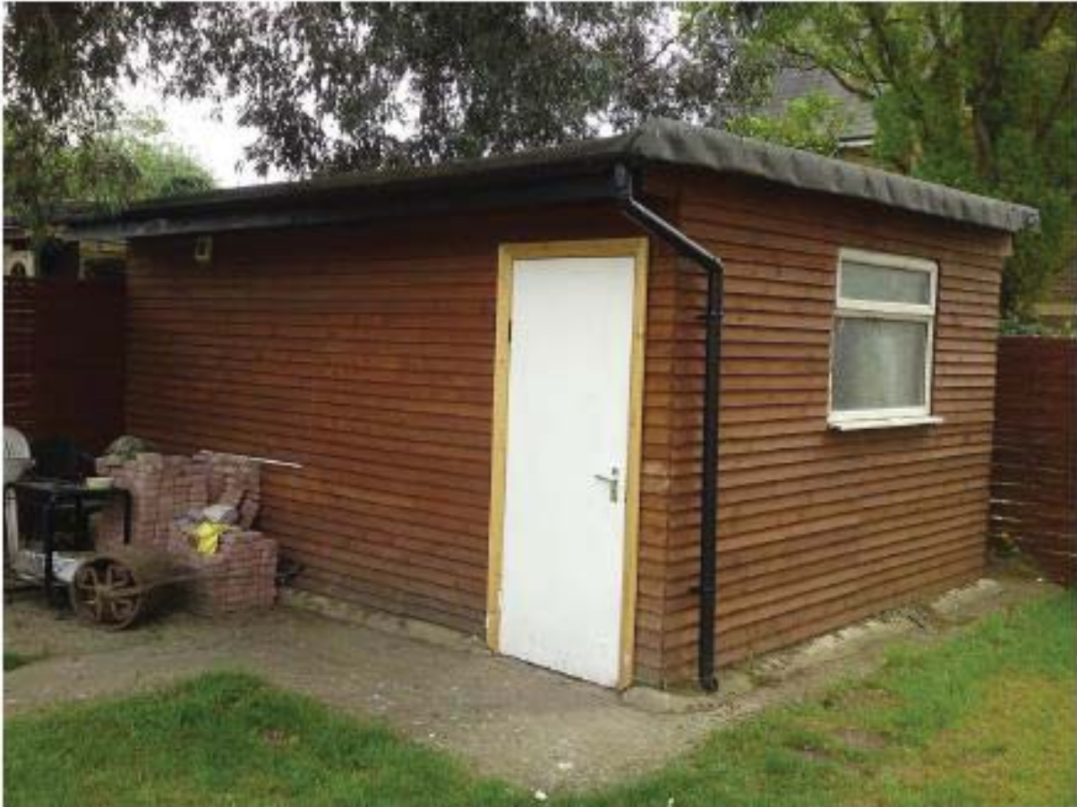
Wooden building to east of the site (in front of new building)