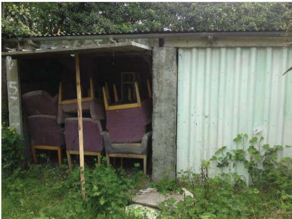
Garage in rear access seats do belong to the B&B