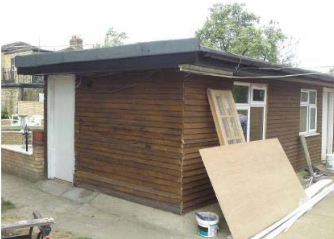
Wooden building to west of site