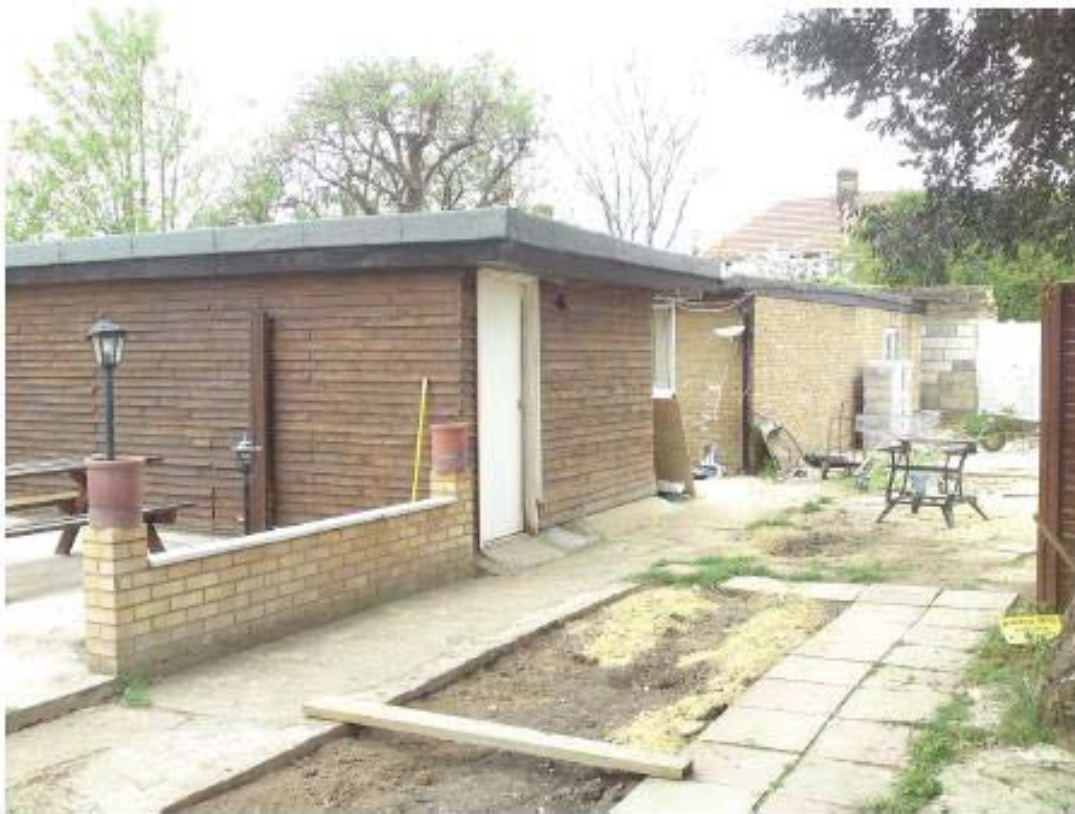
Looking to west of garden