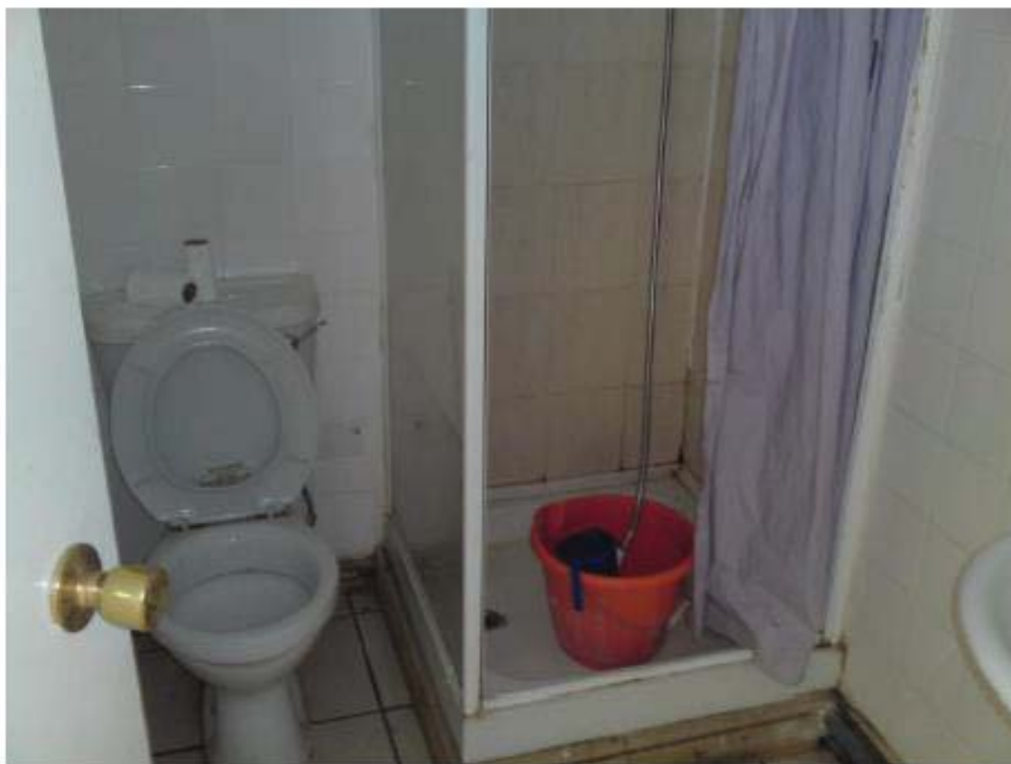
Inside garage/store 3