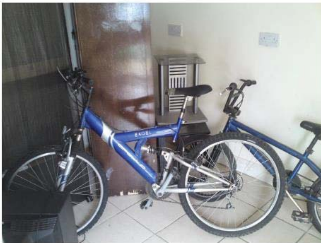
Inside garage/store 4