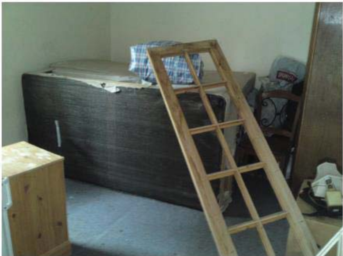
Inside garage/store 2