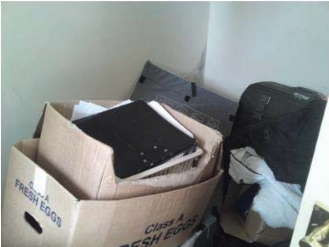
Inside that building - storage