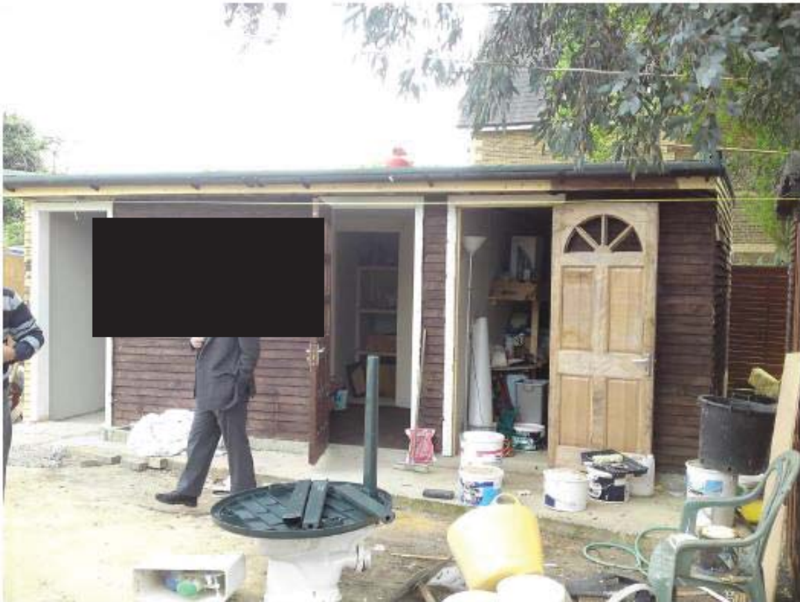
New building to east of site