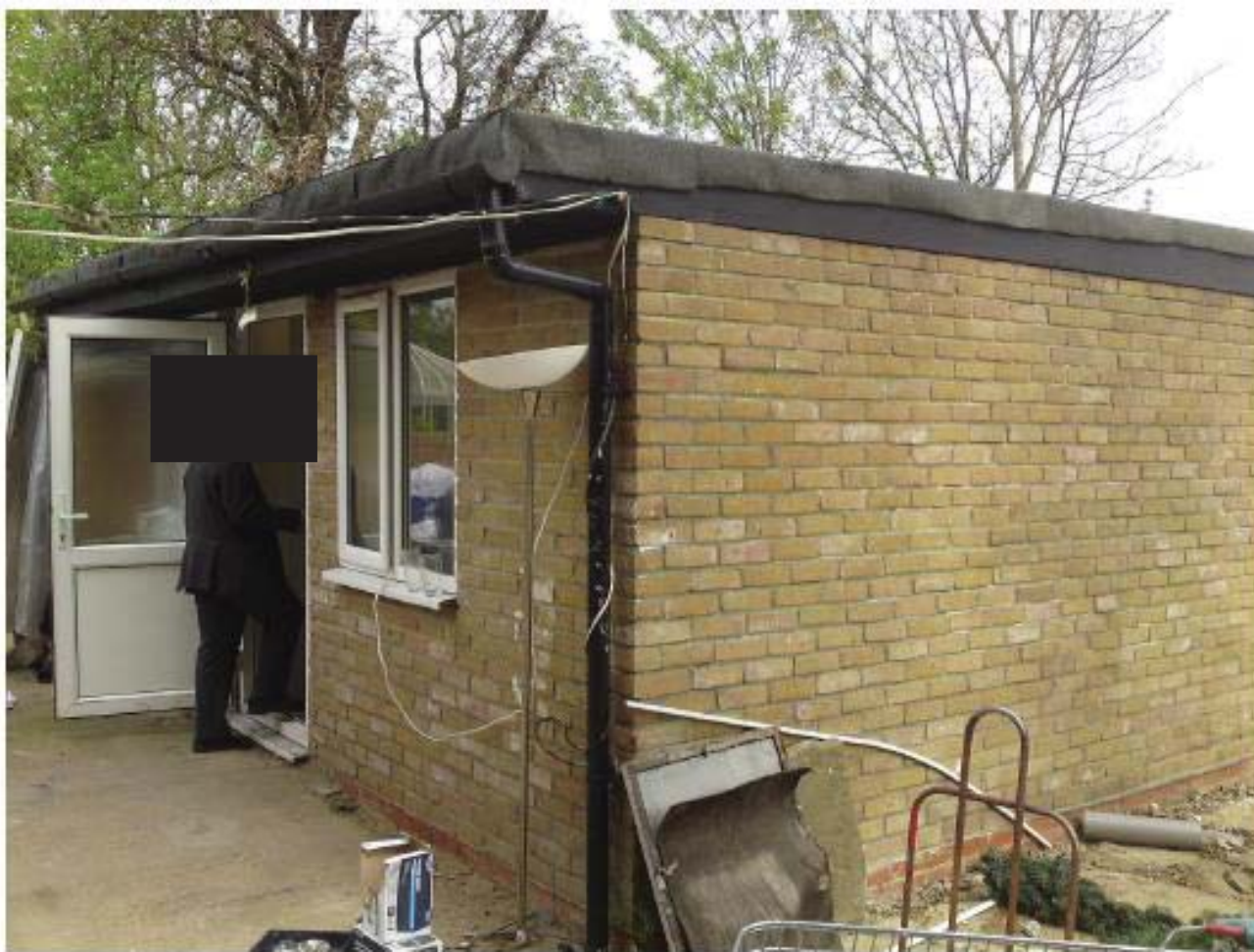
Replacement garage/store to rear of site on west side