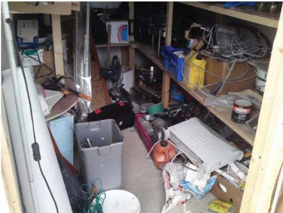
Inside new building 1