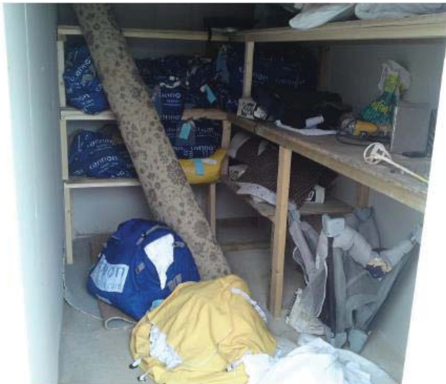
Inside new building 3