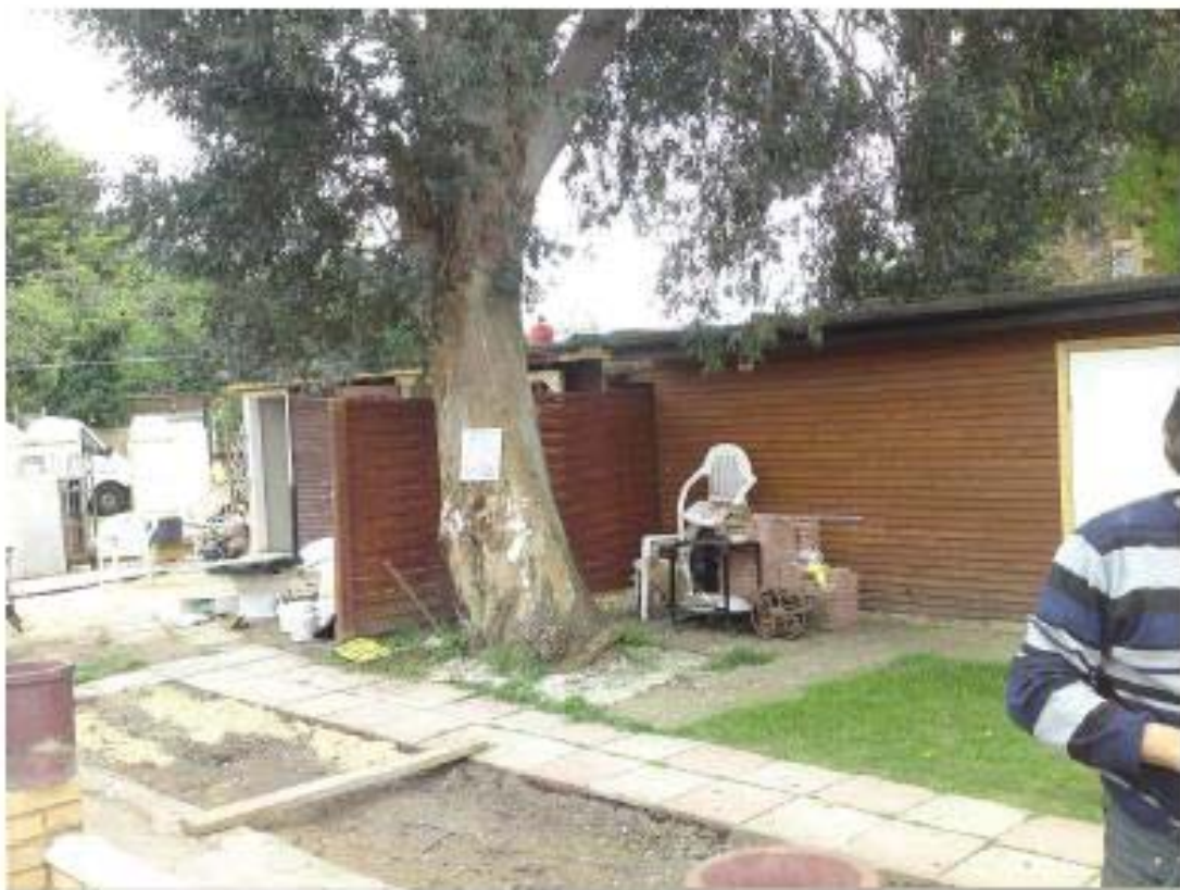
Looking to east of garden