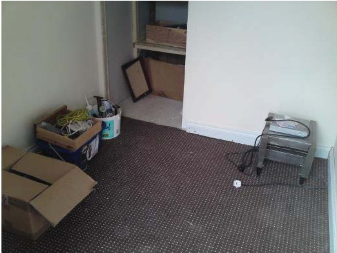
Inside new building 2