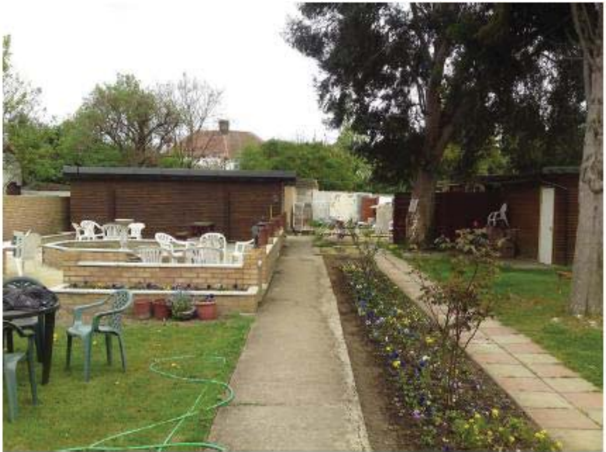
Long view of garden