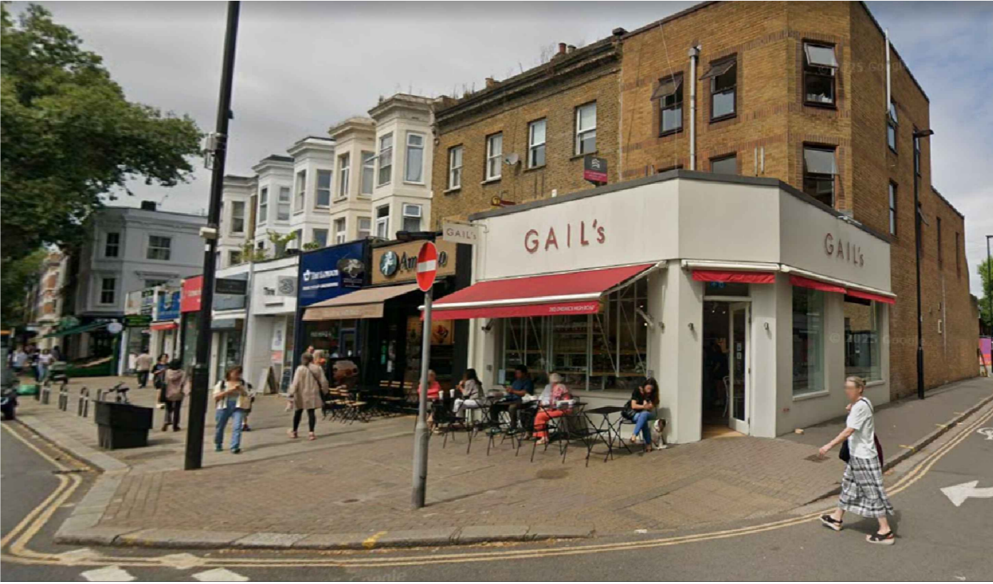
IMAGE OF PAVEMENT AREA

These drawings are for design intent purposes only. Contractor to develop construction design accordingly.