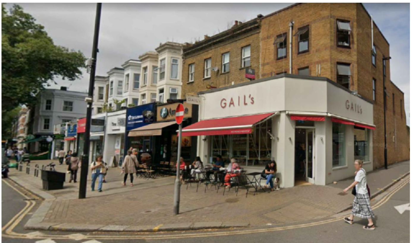
IMAGE OF PAVEMENT AREA