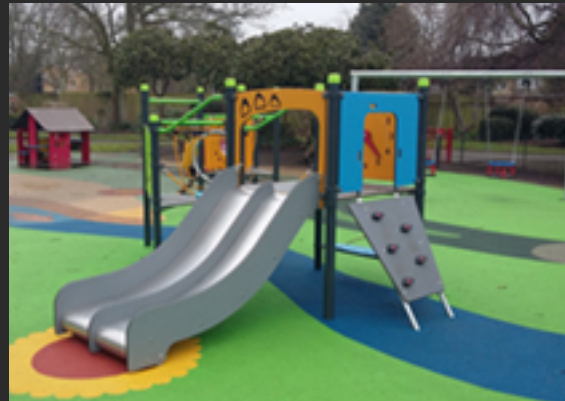
Improvements to Jersey Gardens