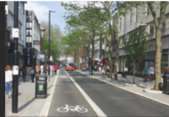
Bus Lane at Hounslow High street