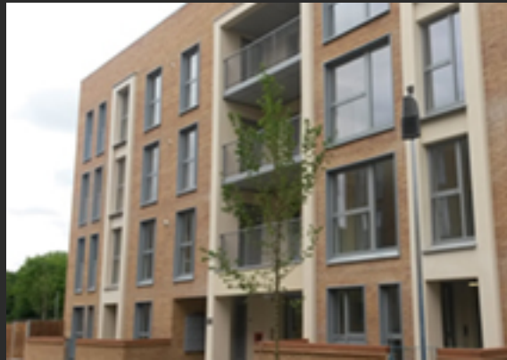
Manor Lane Feltham – 34 new council homes in 2015/16