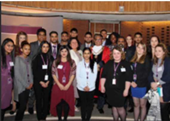
More than 60 apprentices have been recruited