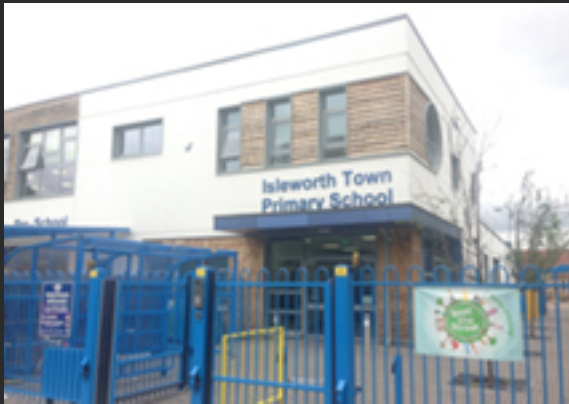
Extension to Isleworth Town Primary School