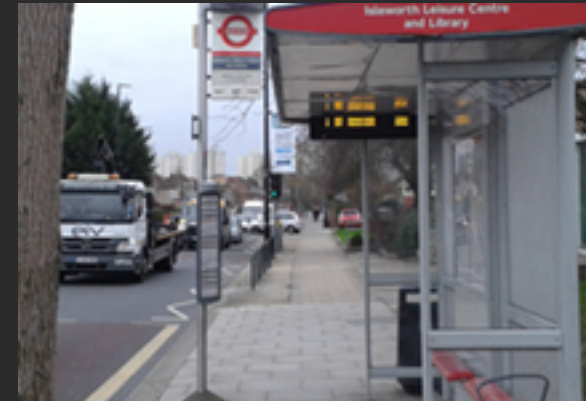
Bus Counters across the borough