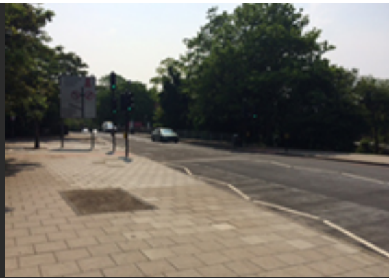
Improvements around Syon Lane station