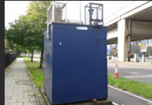
Air-quality monitor on the Great West road