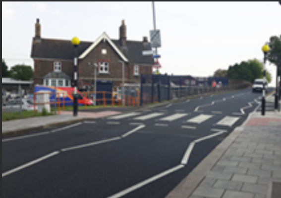
Whitton Road crossing