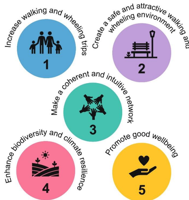
Figure 1: Action plan objectives

This Action Plan is supported by targets which provide direction and set the level of ambition. These have been developed in line with the MTS and Transport for London’s (TfL) Walking Action Plan.