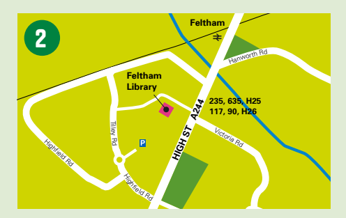
Feltham Library The Centre, High Street Feltham TW13 4GU