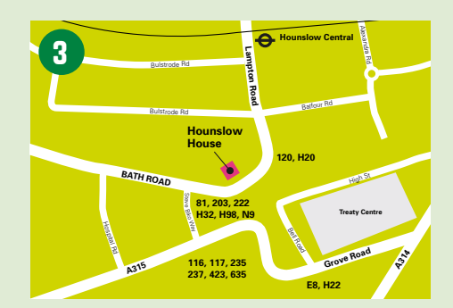
Hounslow House 7 Bath Road, Hounslow TW3 3EB