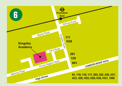
Kingsley Cecil Road, Hounslow TW3 1NX