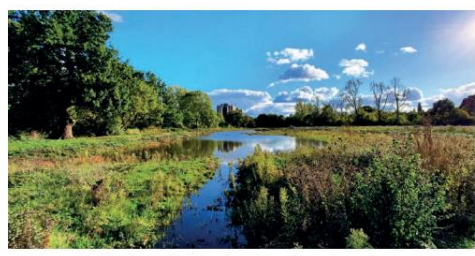
The channel joining the seasonal pond

Figure 5-2 Examples of Natural Flood Management schemes