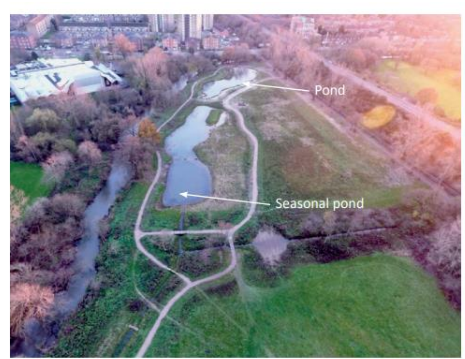
The ponds in the winter with high water levels