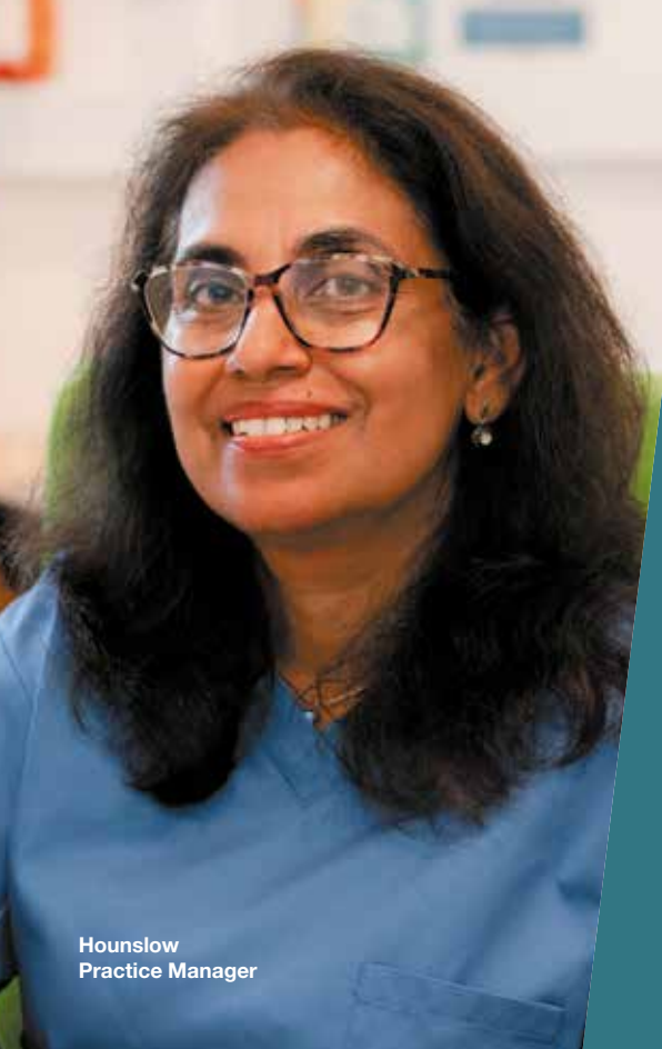
Hounslow Practice Manager

Boost your immunity, have the flu and COVID-19 autumn booster. It's the best way to protect yourself this winter.