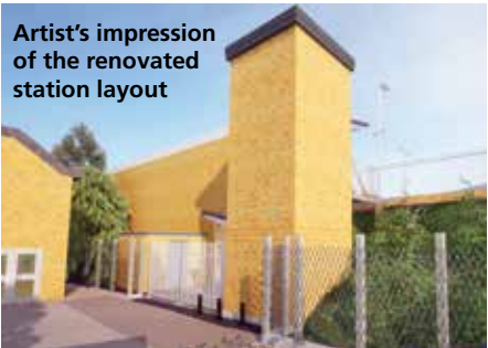
Artist's impression of the renovated station layout

Work on the station will begin in the new year and is due for completion in late summer 2023. Travellers using the station may face occasional disruption and are advised to follow updates given by Network Rail's website.