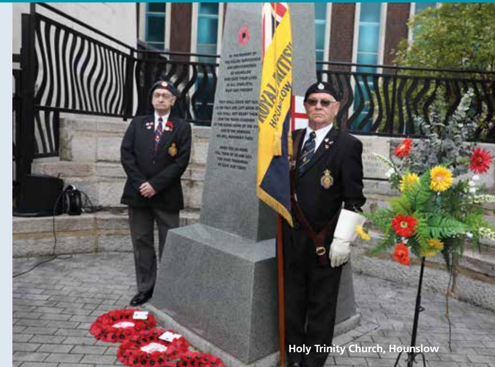
Holy Trinity Church, Hounslow