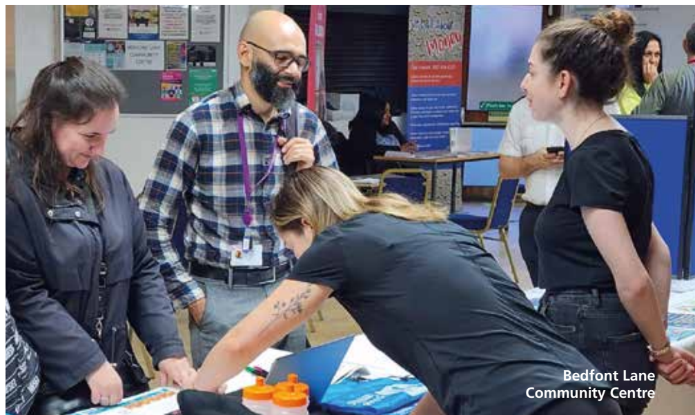
Bedfont Lane Community Centre

"We saw in the pandemic that Hounslow has a fantastic community spirit, so we need people to step up again and support their neighbours."