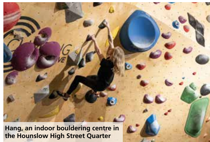
Hang, an indoor bouldering centre in the Hounslow High Street Quarter

with the rest of the borough. Advance for Growth will help supercharge our plans as a business, bringing our brand to people when they are out and about in the borough. We are proud to be born in Hounslow and one of the very first commercial tenants at the prestigious new High Street Quarter development.