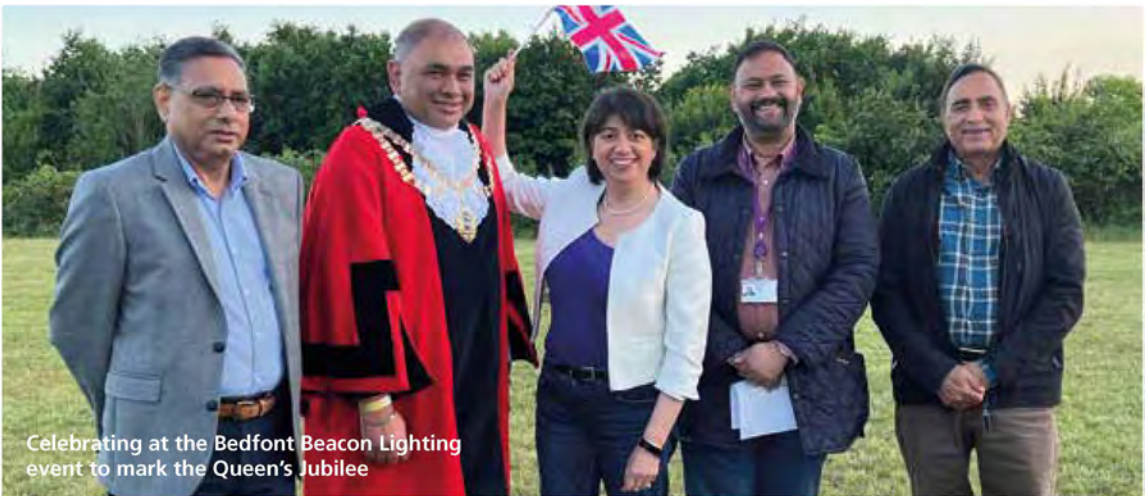
Celebrating at the Bedfont Beacon Lighting event to mark the Queen's Jubilee

I can't wait to show residents, businesses, and local community groups that the Council is on their side, and we will be working to develop better ways of engaging and working with residents, communities and businesses. I'm also excited to continue the work of my previous role as Cabinet Member for Finance – helping our local economy to thrive by continuing the 'Keep it Local' campaign and building community wealth, alongside continuing to provide business support to help firms launch and grow within the borough.