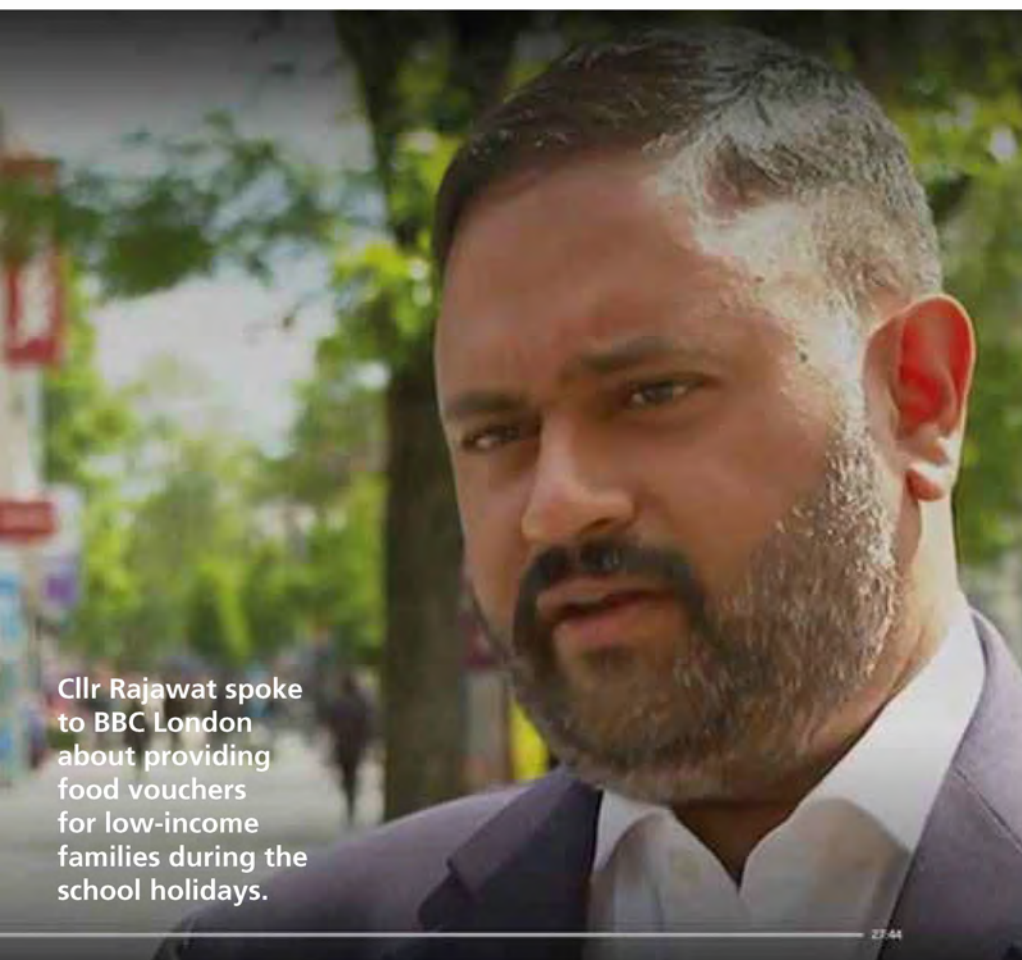
Cllr Rajawat spoke to BBC London about providing food vouchers for low-income families during the school holidays.

Many families may find themselves struggling because of the recent increase in the price of items such as food, energy and fuel, so the Council is looking at how it can support people during this challenging time.