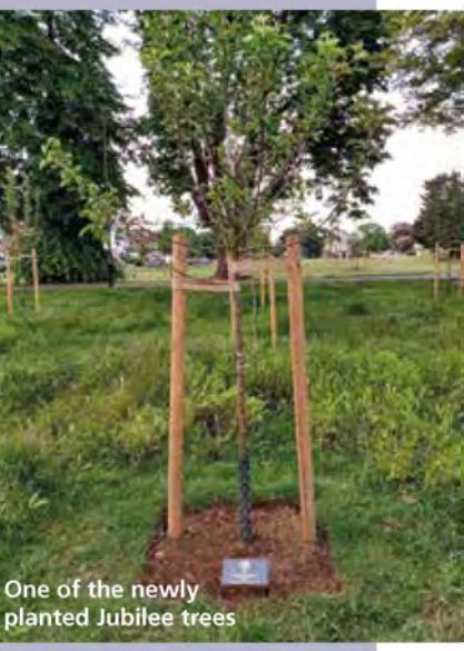
One of the newly planted Jubilee trees

"The Council is committed to making our borough a cleaner, greener and healthier place for everyone. Planting trees for everyone to enjoy is a great way of helping to achieve this."