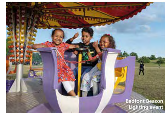
Bedfont Beacon Lighting event

Other activities at Bedfont Lakes included lantern-making, an outdoor movie screening, a funfair and self-led trails through the great outdoors.