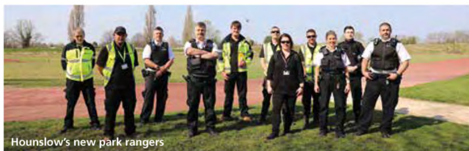
Hounslow's new park rangers

The ranger service is a joint initiative between Hounslow Council and its parks partner, Lampton Community Services (LCS).