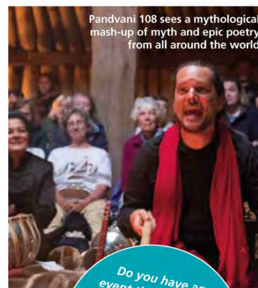
Pandvani 108 sees a mythological mash-up of myth and epic poetry from all around the world

28 August, 11am – 1pm Shrewsbury Walk, Isleworth Everyone