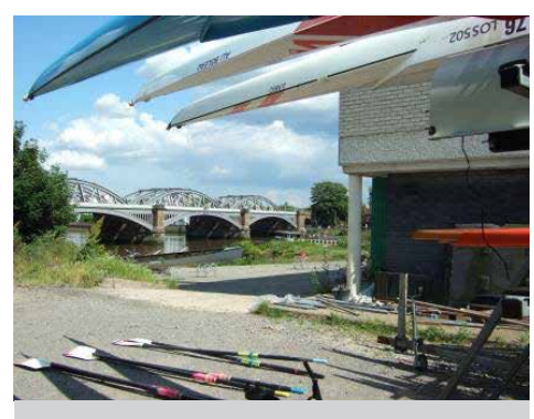
Chsiwick Boat House

Dukes Meadows features a mix of public and private sports clubs and playing fields. More than 75% of the site is used for formal recreation, making it one of the largest centres for sport in West London, including facilities for cricket, rowing, tennis, rugby, hockey, golf, bowls and football. An estimated one million–plus visits are made to the park each year, playing a key role in enhancing the health and wellbeing of local people. Owing to the large number of teams that play at Dukes Meadows, the FA has designated it a site of high priority for football and it has the potential to be a Parklife hub site. The site is complex, with a wide range of facilities and a diverse visitor base. Provision is spread across a large number of leaseholders and other stakeholders, including the Dukes Meadows Trust (DMT) which manages part of the park.