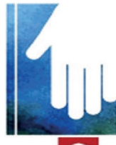
RULE OF LAW