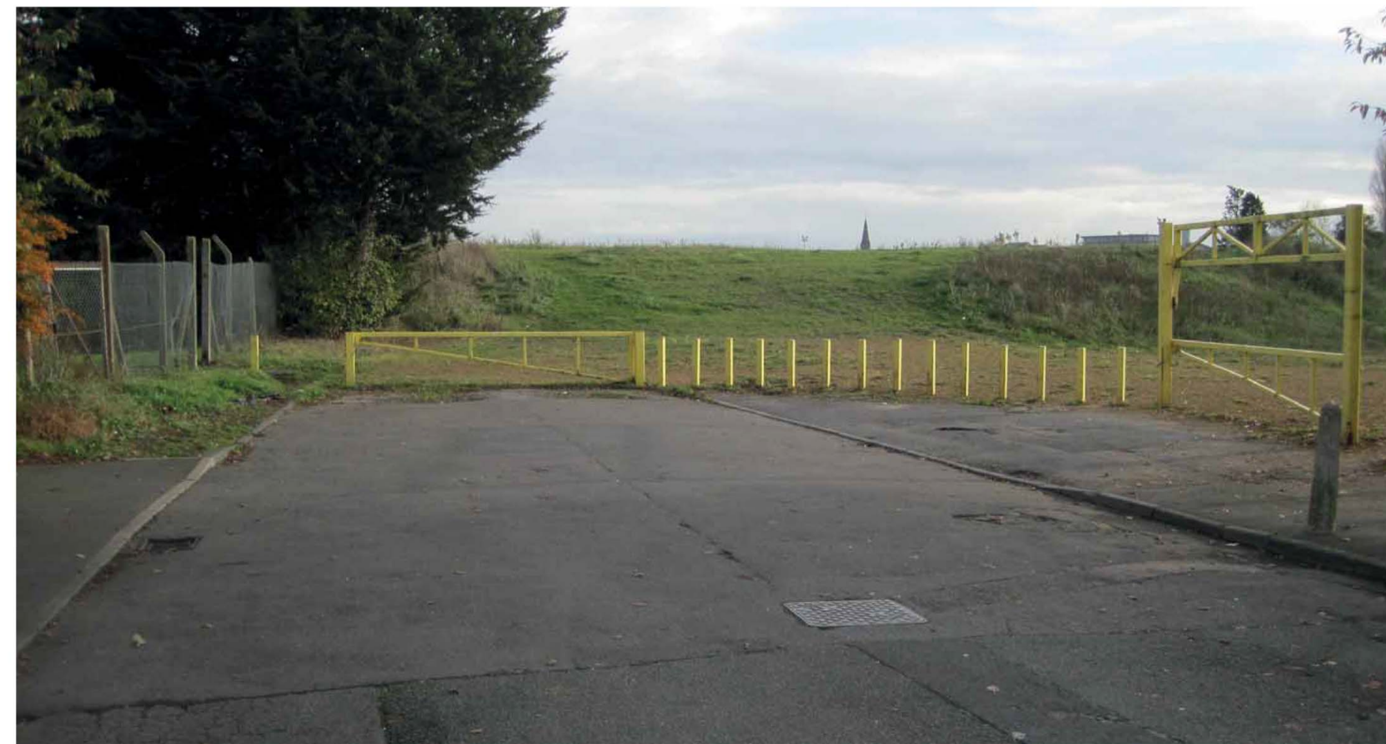
Shakespeare Avenue Entrance - Existing