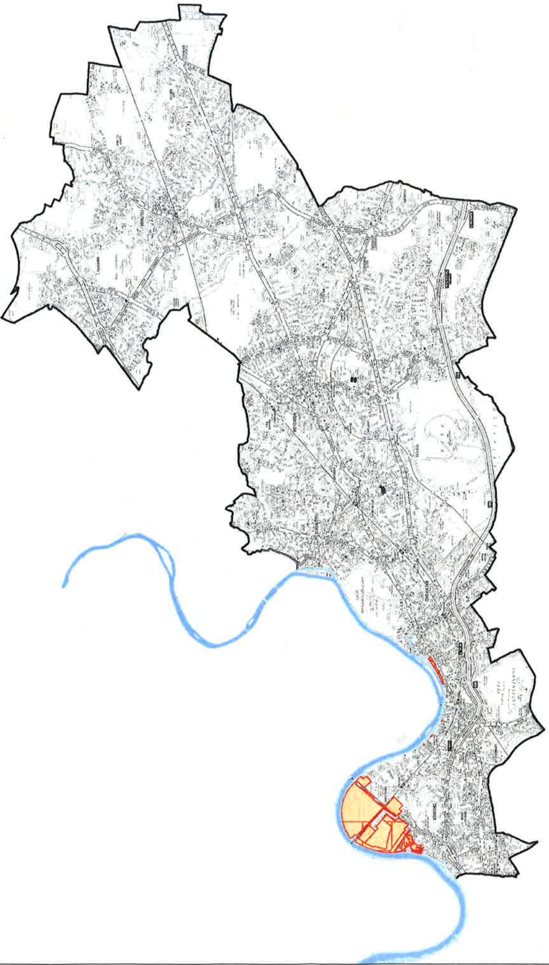
Appendix 3 Borough wide map with River View