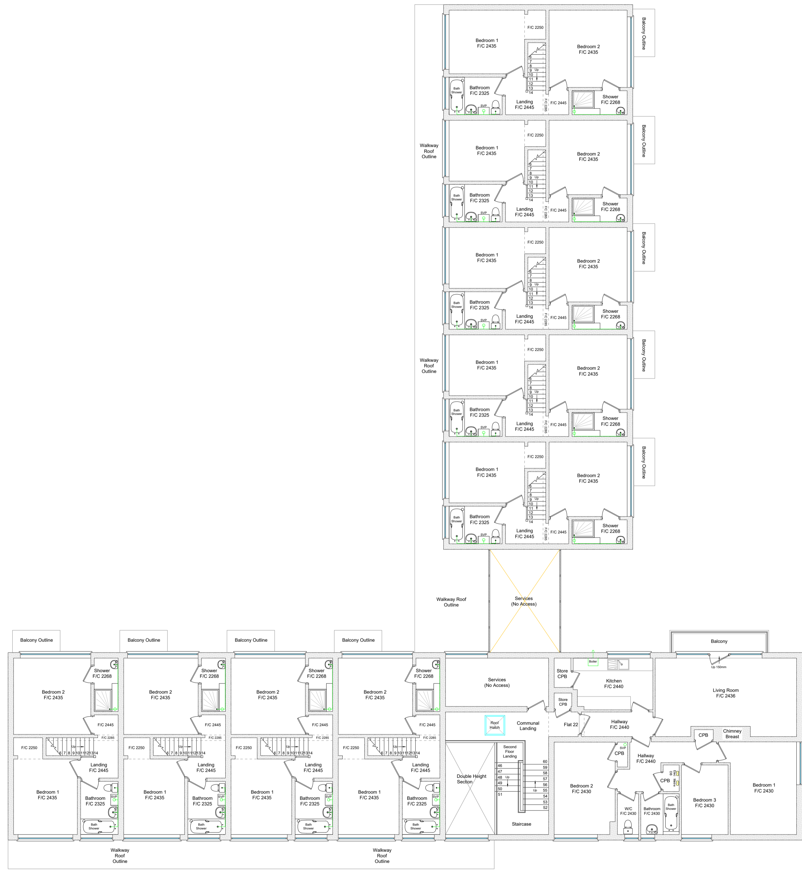
Existing Third Floor Plan

NOTES: Report all discrepancies, errors and omissions. Do not scale from this drawing. Verify all dimensions on site before commencing any work or preparing shop drawings. All materials, components and workmanship are to comply with all the relevant British Standards, Codes of Practice, and appropriate manufacturers recommendations that from time to time shall apply. For all specialist work, see relevant drawings. This drawing and design are copyright of PELLINGS LLP