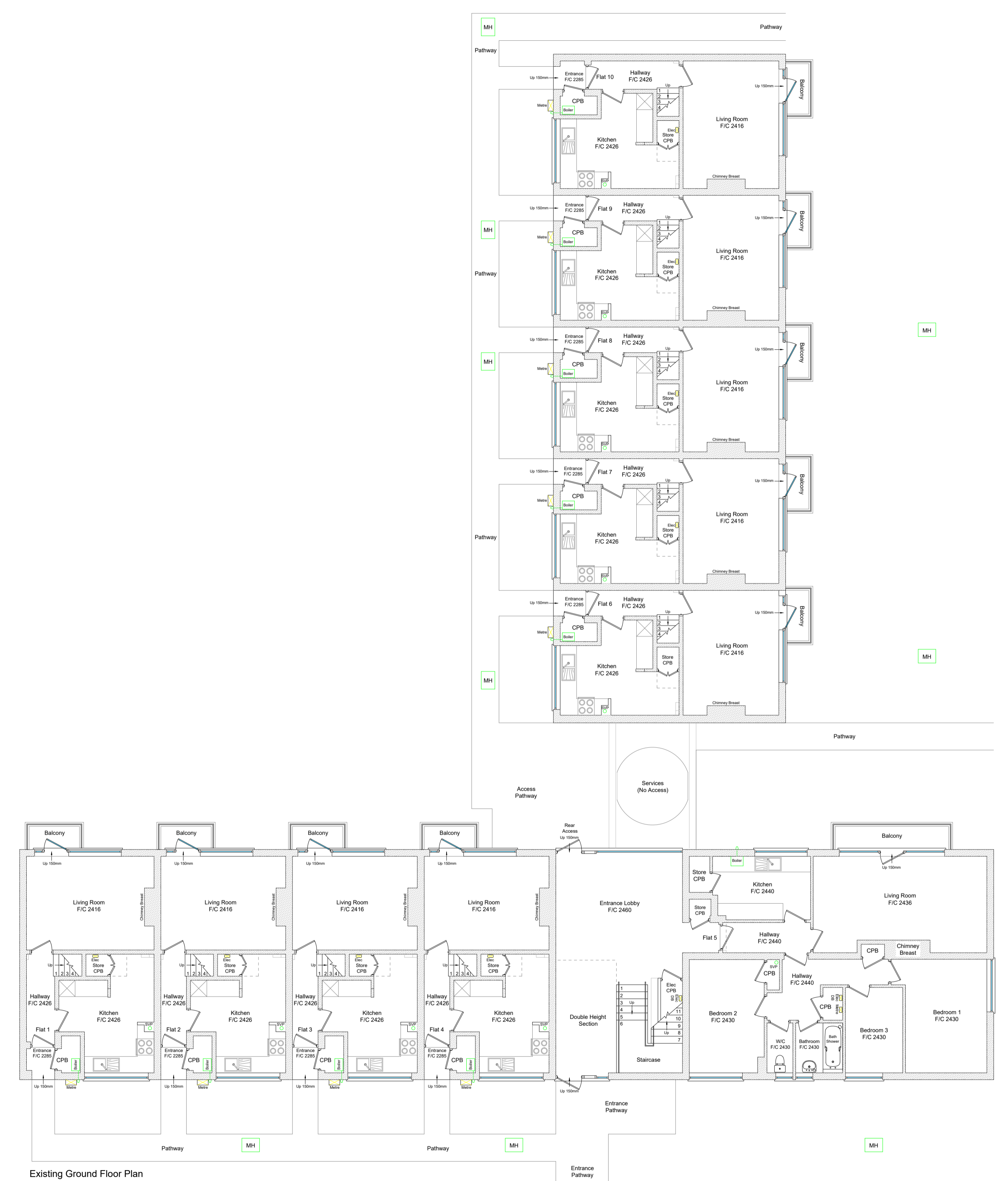
Existing Ground Floor Plan

NOTES: Report all discrepancies, errors and omissions. Do not scale from this drawing. Verify all dimensions on site before commencing any work or preparing shop drawings. All materials, components and workmanship are to comply with all the relevant British Standards, Codes of Practice, and appropriate manufacturers recommendations that from time to time shall apply. For all specialist work, see relevant drawings. This drawing and design are copyright of PELLINGS LLP